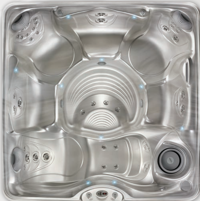
Shown in Champagne Opal